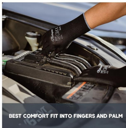
BEST COMFORT FIT INTO FINGERS AND PALM